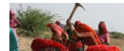
DAILY WAGE WORKERS