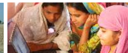
WOMEN & CHILDREN