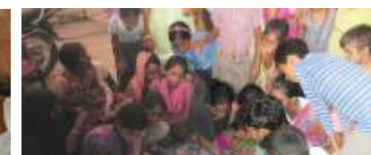
SCs & STs